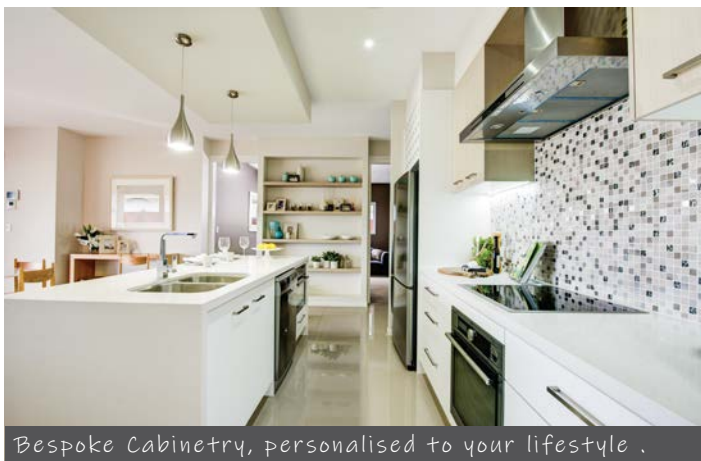
Bespoke Cabinetry, personalised to your lifestyle .