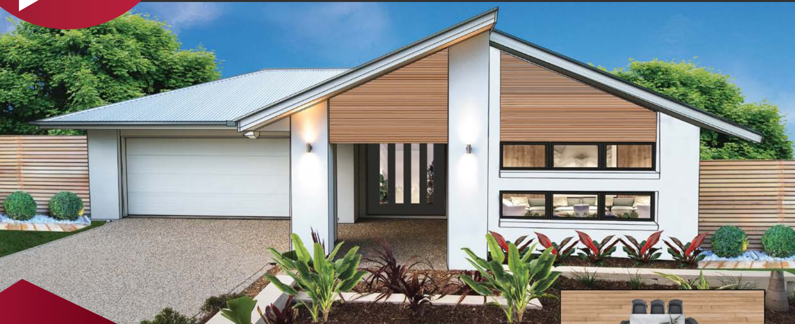
The Waratah by McLachlan Homes.